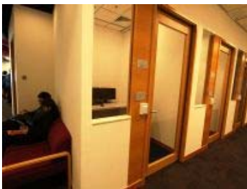
AV Editing Suites