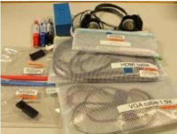
Accessory items for loan