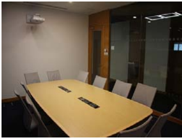
LC Study Rooms