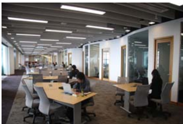
Open Study Area